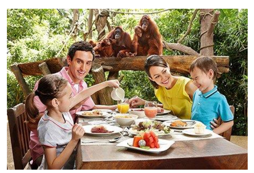
5)Present Continuous (Look!)