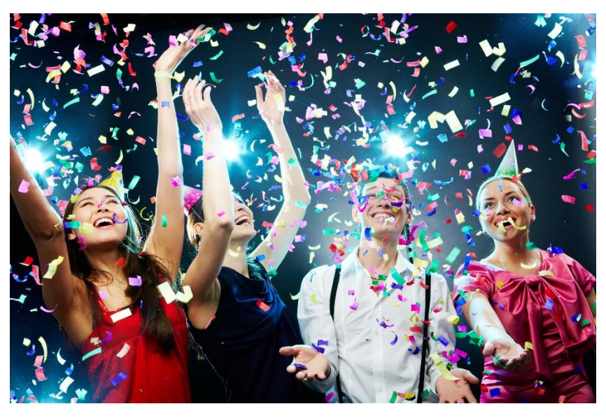
Exercise 6 Make up sentences or situations using the tenses in the brackets