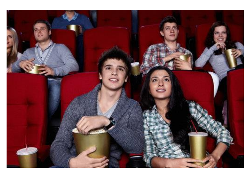
6) Present Simple (seldom)