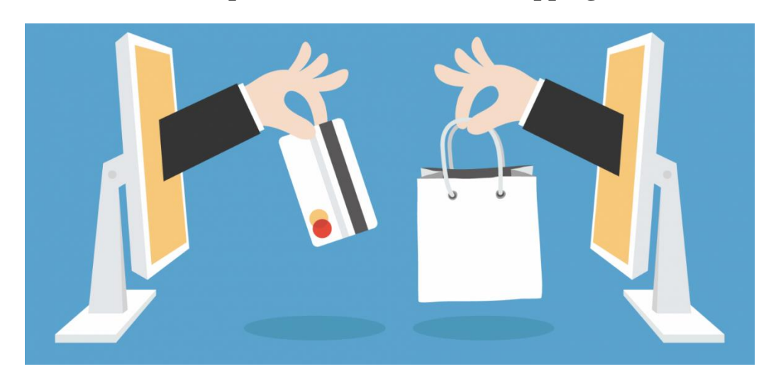
Exercise 2 Discuss the pros and cons of online shopping