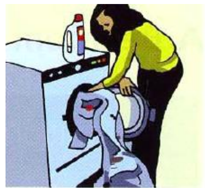
putting the dirty clothes in the washing mashing