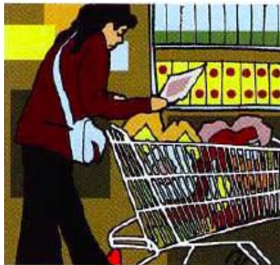
doing the shopping