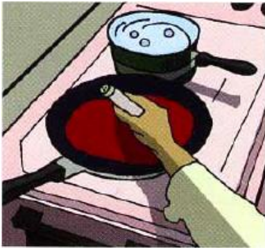
cooking lunch for family