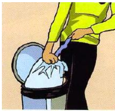
emptying the wastebasket