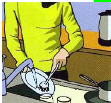
doing the washing up