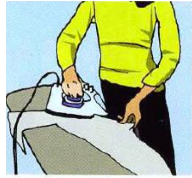
doing the ironing