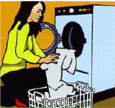
taking the washing out of the washing machine