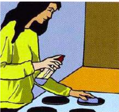
cleaning the cooker