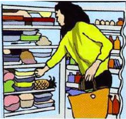
putting the shopping away