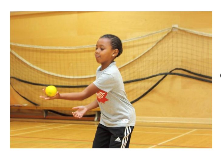
( just/ catch)