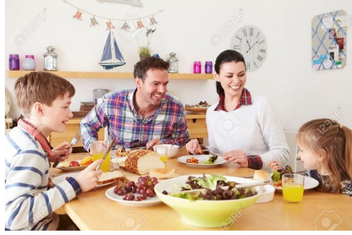
Exercise 4 Describe the pictures using Past Simple or Present Perfect