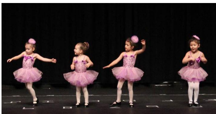
( The girls/ not dance/ last week)