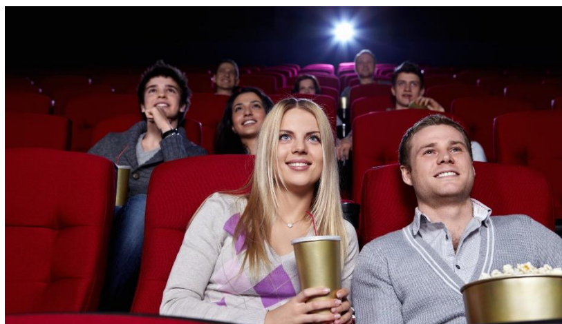
(They/ watch/ the whole evening/ yesterday)