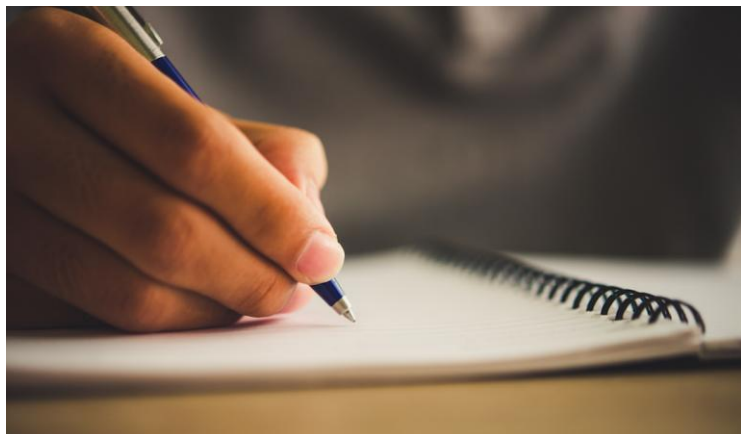
( He/ already/ do/ homework)