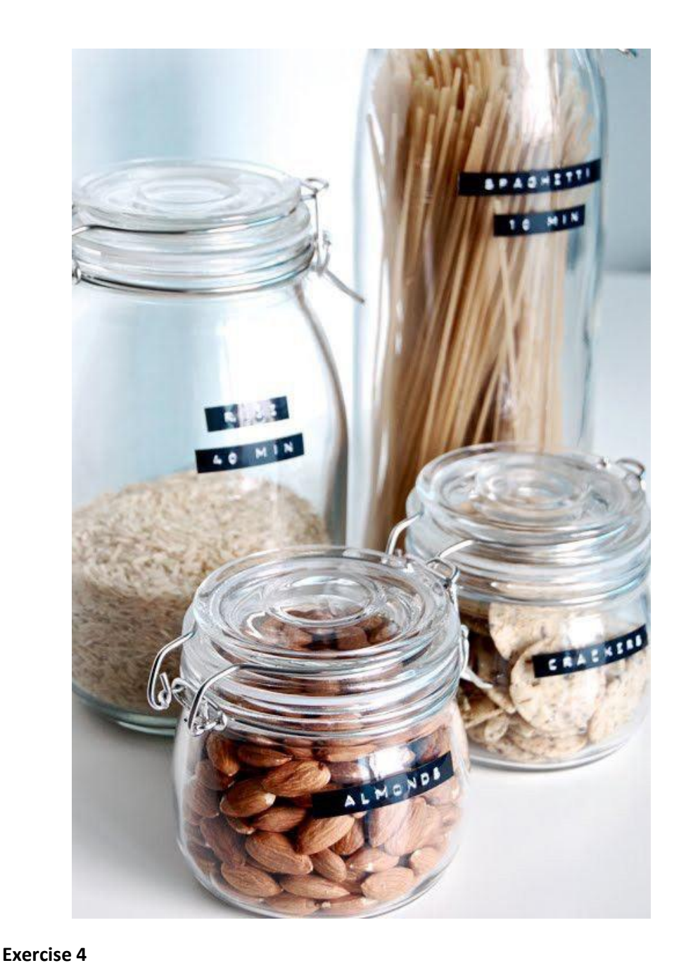
Fill the gaps with the words form the box