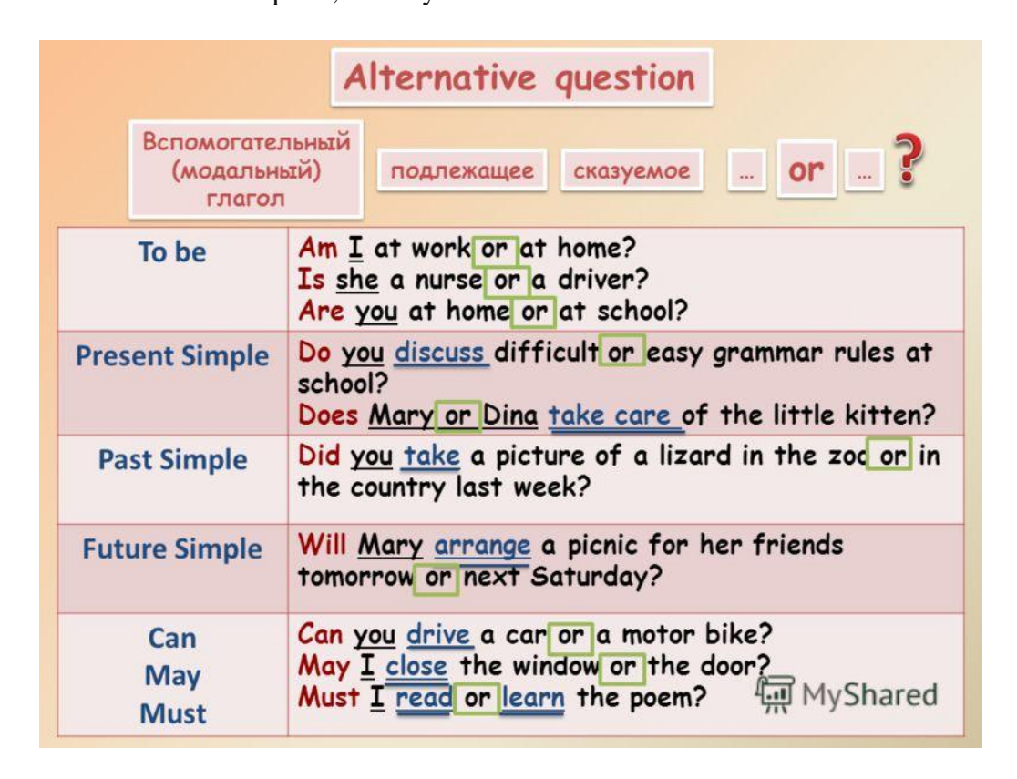
Ex. 4 Put the questions in order