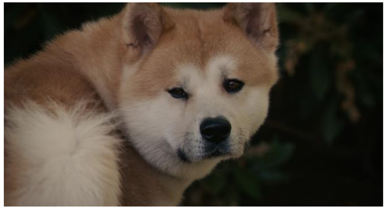
Ex. 1 Look at the pictures. What do you know about the man and the dog?