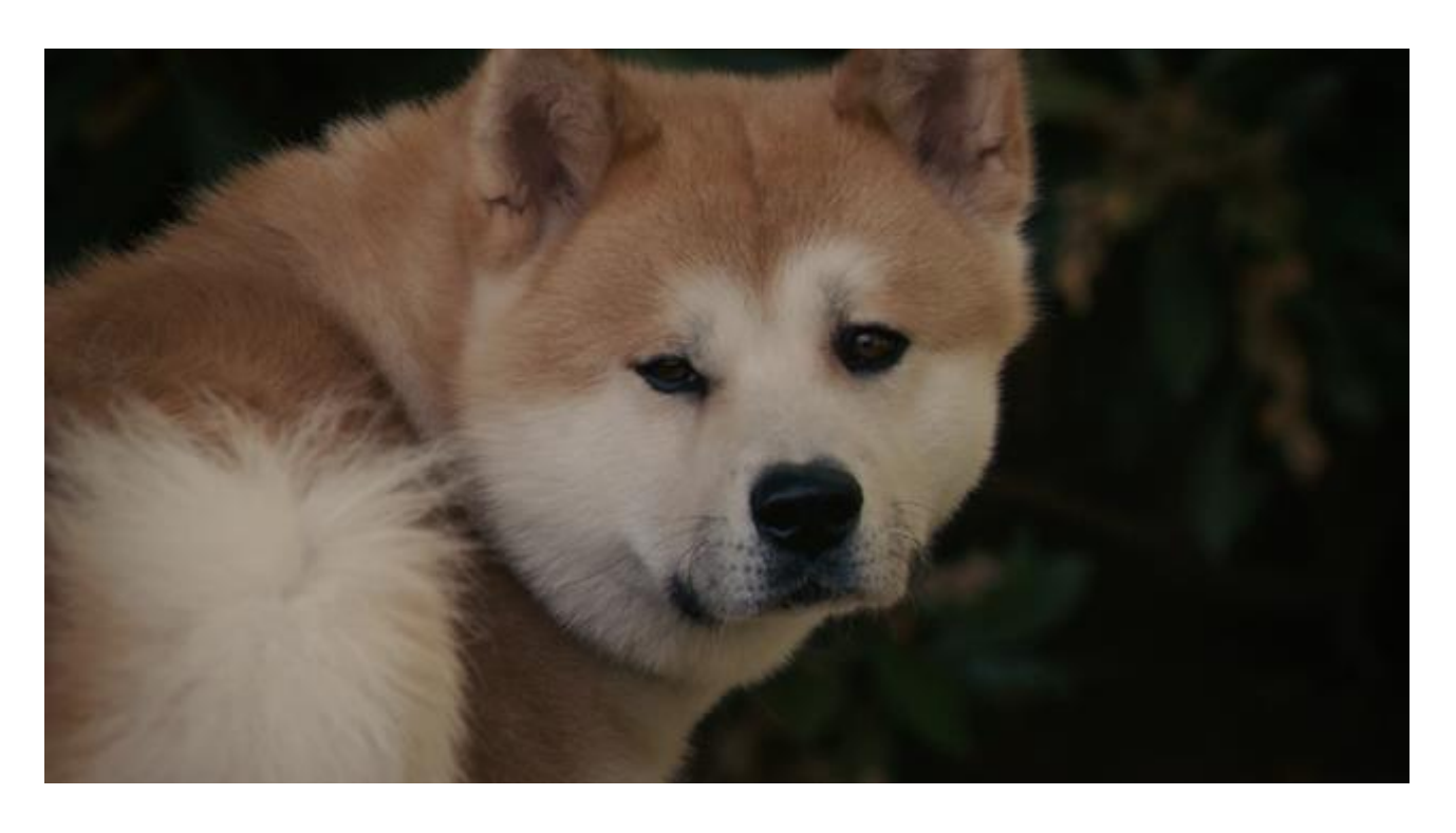
Ex. 1 Look at the pictures. What do you know about the man and the dog?