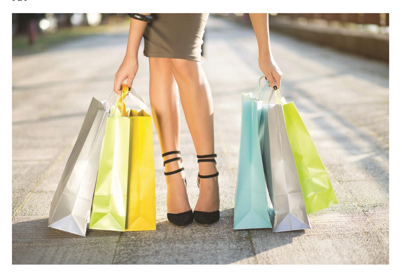
Ex. 1 Read the explanations of the phrases below carefully and choose the answer which you think is correct.