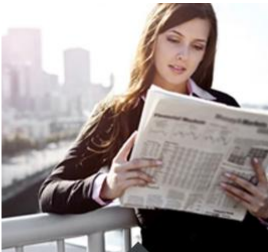
( Future Continuous)